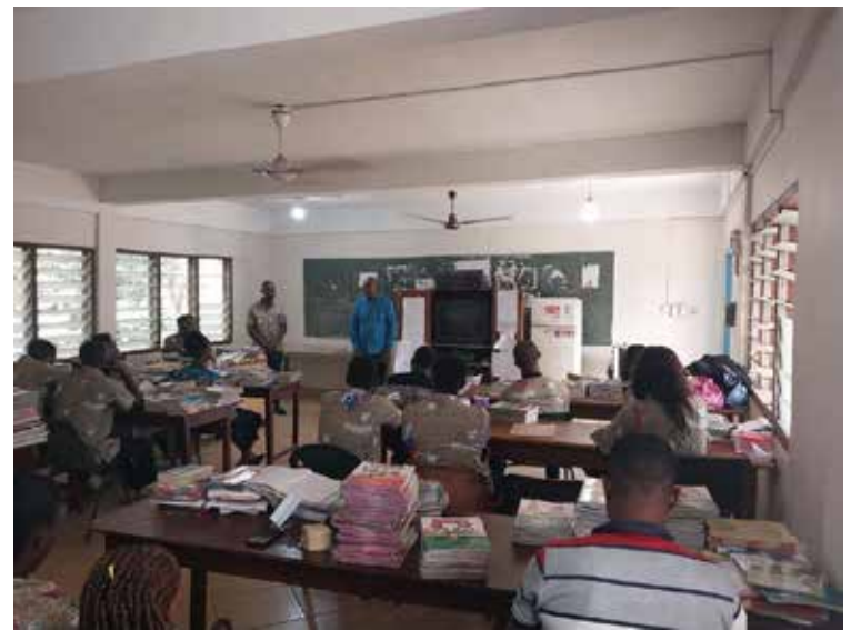
The Provincial had a session with teachers of the school